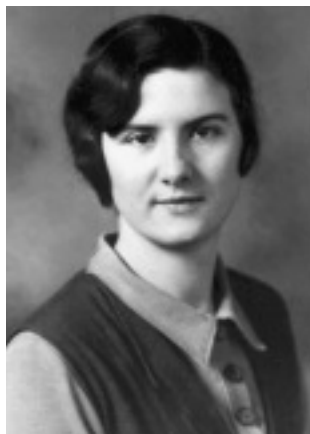
Presbyterian Historical Society, Presbyterian Church (U. S. A.) (Philadelphia, PA)