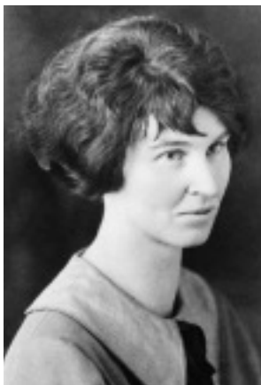
Presbyterian Historical Society, Presbyterian Church (U. S. A.) (Philadelphia, PA)