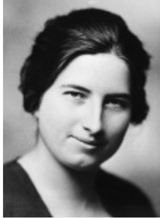
Presbyterian Historical Society, Presbyterian Church (U. S. A.) (Philadelphia, PA)