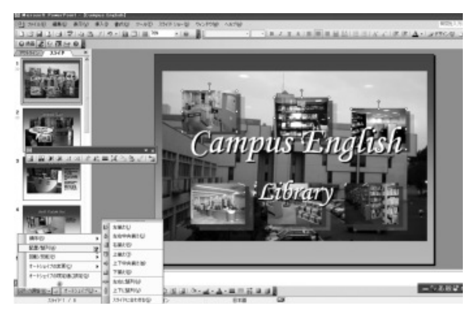
[Figure 2.1] Alignment