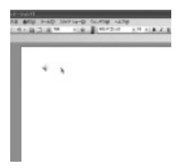
[Figure 3.3] New Slide

Find and select the sound file to add, and click OK. The sound icon will appear in the slide. Drag the icon where you want to have the file on your slide.