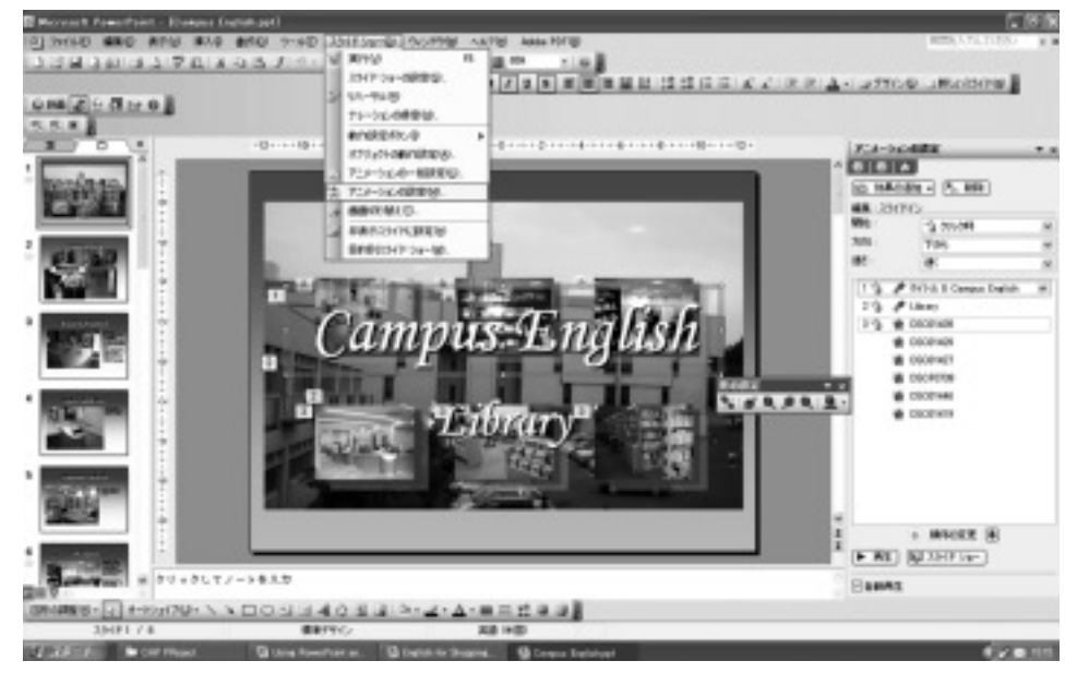
[Figure 1.2] Custom Animation (アニメーションの設定)

Task Flow To Use Custom Animation (アニメーションの設定)