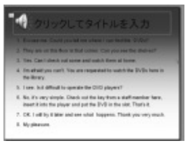
[Figure 4] Subtiles

Task Flow to Make Scripts Behave Like Subtitles