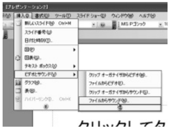
[Figure 3] Insertion of Sound Files