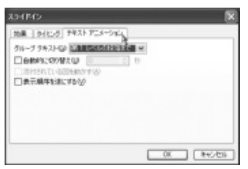
[Figure 4.2] Fly In Dialog Pane